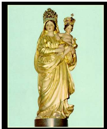
The miraculous image of Our Lady of Prompt Succor, New Orleans, honored on January 15th.

“This Queen is so compassionate and benign, that when a sinner, whoever he may be, recommends himself to Her charity, she does not question his merits, or if he is worthy, but she hears and succors all.” – St. Bernard