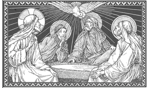
The Paraclete, whom I will send you from the Father, the Spirit of truth, who proceedeth from the Father.