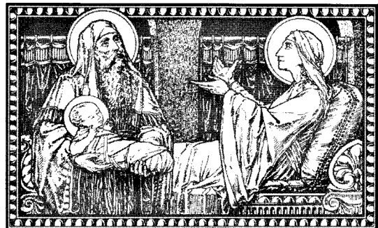
PRAYER IN HONOR OF THE HOLY FAMILY