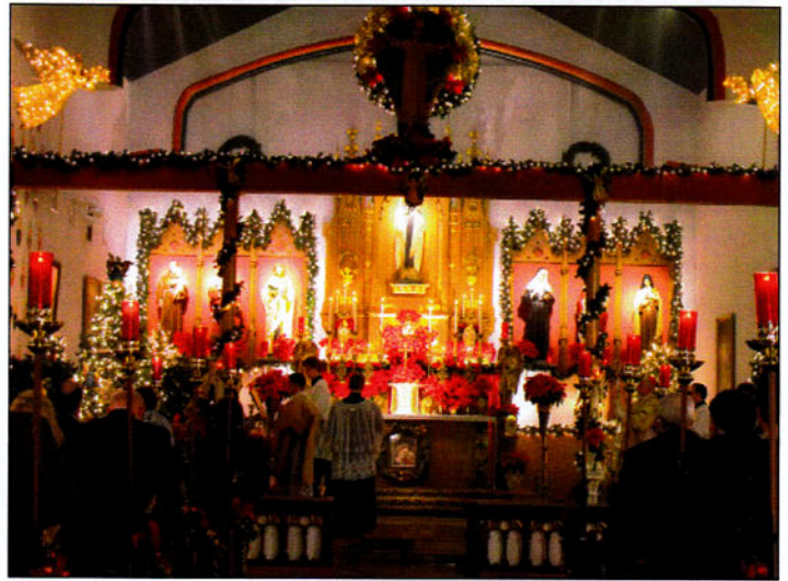
Our beautifully decorated church at the Pontifical Midnight Mass, was filled with Catholic faithful who wished to adore their newborn King.