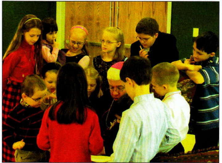
Our youngsters at St. Gertrude the Great surround "their" Bishop as he reads an assortment of prose and poetry during the course of the annual Holy Innocents party given in their honor each December twenty-eighth.