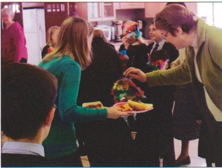
Mardi Gras is always observed at St. Gertrude the Great School. Students, teachers, and parents enjoyed an afternoon of treats and games prior to the beginning of the Lenten season on Ash Wednesday.