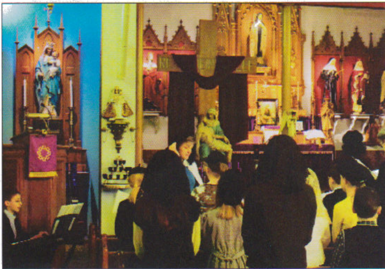
The children sing at Mass everyday at St. Gertrude the Great School. Part of the annual Children's Day of Recollection program is assistance at Holy Mass. (Above) One of our talented fifth graders accompanies the children on his "pipe organ."