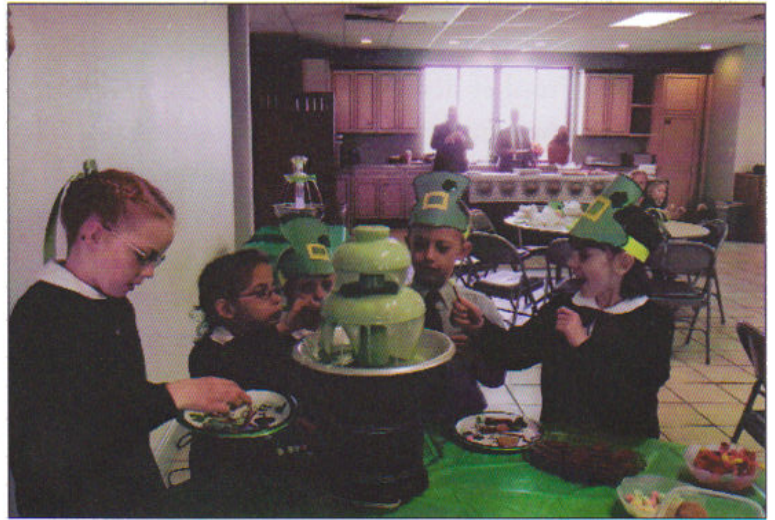
It just wouldn't be St. Patrick's Day at St. Gertrude the Great without some special observance. After assisting at a high Mass honoring the patron saint of the Irish, ourschool children were treated to lunch, treats, and games!