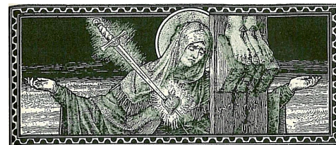
THERE STOOD BY THE CROSS OF JESUS, HIS MOTHER