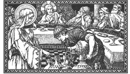
JESUS CHANGES THE WATER INTO WINE AT THE MARRIAGE FEAST OF CANA

St Marius & Companions, Mm St Canute, King, M