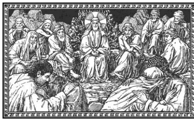
BE RECONCILED TO THY BROTHER

The blessing of the St. John's Fire takes place after the potluck, with entertainment and the recitation of the Rosary to conclude.