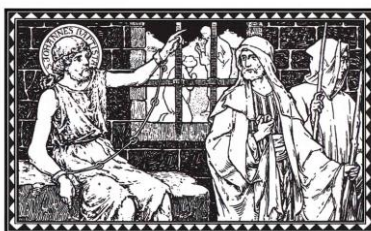
JOHN, IN PRISON, SENT TWO OF HIS DISCIPLES TO CHRIST.

Second Sunday of Advent: The light approaches; hope changes into the certitude of deliverance: We shall have our Liberator!