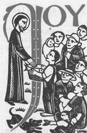
Jesus took the loaves and He distributed them

JOY IS analyzed in today's liturgy! True liberty (EPISTLE) and the true satisfaction of hunger (GOSPEL) are the causes of joy . Our moderns talk much of freedom; but freedom from what! The more they talk about freedom, the more heavily do they become chained in “bondage.” In the EPISTLE a contrast is drawn between the slave son of a slave girl (symbolizing the fear begotten by the Mosaic law) and the free son of a free woman (symbolizing the love inspired by Jesus). The EPISTLE indicates also how