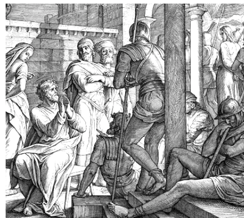
The Denial of St. Peter