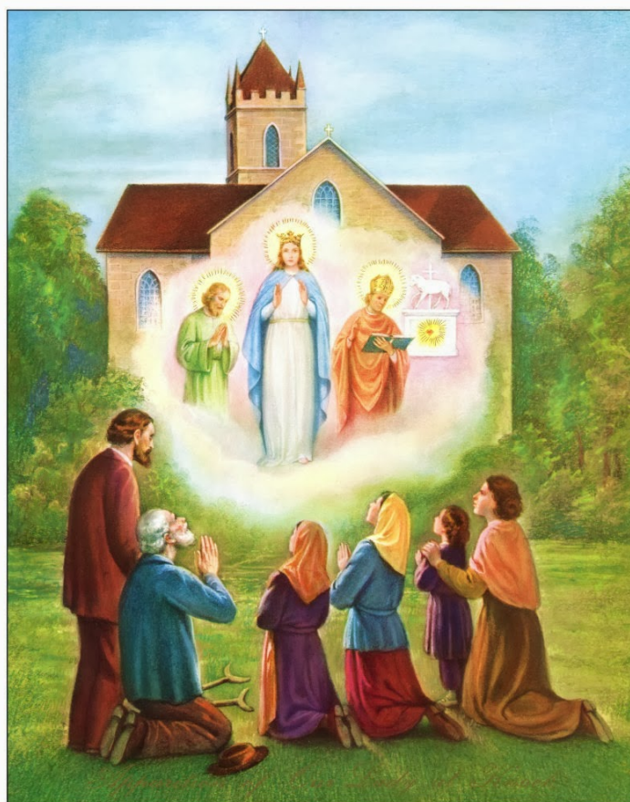
Our Lady of Knock