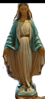
Vintage BV Mary Statue

Keep & Sign your ticket for prize drawings