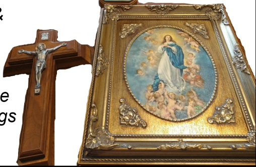
Assumption of BV Mary Picture