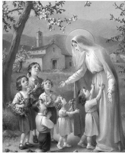
Not even mothers themselves know all the charms contained in their maternity. Their love is the richest of all love after that of God's love, because it is the most fruitful.

— Monsigneur Landriot The Valiant Woman: Conferences for Women