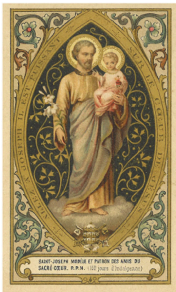
St. Joseph of the Sacred Heart