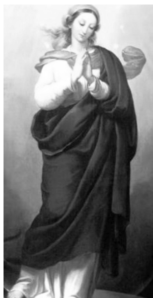
Our Lady, Mother of Mercy, pray for us.

Pray, O St. Apollinaris, that both pastor and flocks throughout the Church may, now at least, profit by these apostolic and divine teachings, so that we may all one day have a place at the eternal banquet, where Our Lord invites His own to sit down with St. Peter and thee in His Kingdom. Amen.