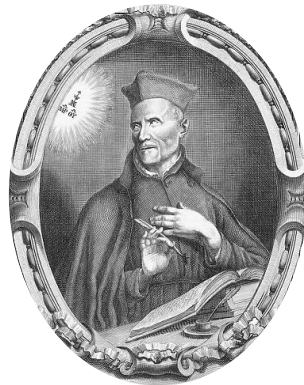
St. Joseph Calasanz