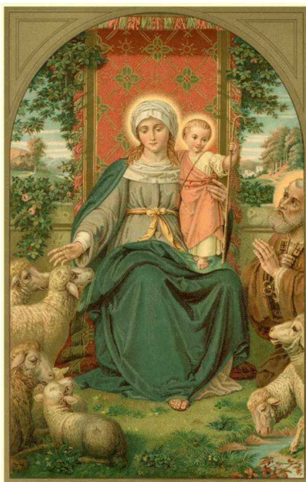
Holy Mary, Mother of the Divine Shepherd

On Tuesday we conclude our Summer Novena honor of St. Anthony of Padua and Our Mother of Perpetual Help. Masses will be at the usual times of 7 AM, 8 AM, and 5 PM. Come and participate in this powerful devotion.