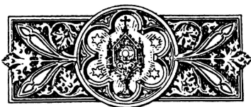
Divine Heart of Jesus, convert sinners, save the dying, deliver the Holy Souls in Purgatory. (300 days indulgence)