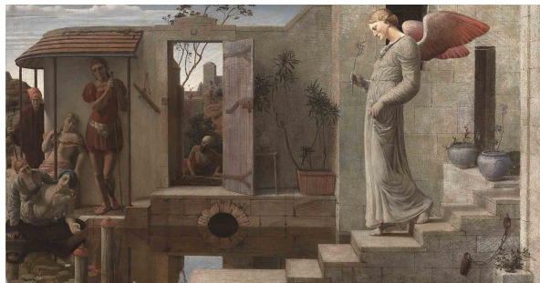
The angel stirs the waters of Bethesda

Practice: To offer a decade of the Rosary in honor of St. Michael and the angels to assist the Church in these days of turmoil.