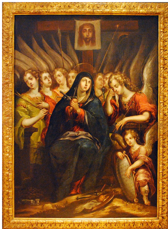
“Blessed is the womb that bore Thee”