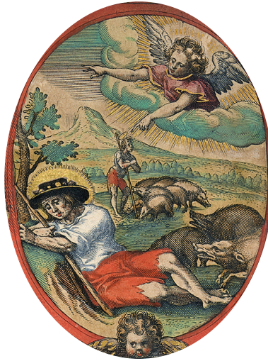
An angel appears to St. Patrick

see the heavens opened, and Jesus standing surrounded by a multitude of angels; and whilst he meditated on these great visions his soul was altogether lost in God.’ Three times in the week the angel Victor visited and conversed with him, filling his soul with celestial consolations. The labors of the day amongst men seem to have been less arduous than those of the night with God.”