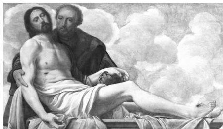
St. Joseph of Arimathea, pray for us.