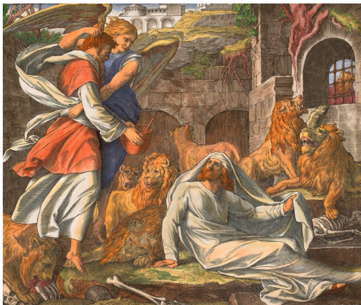
Habakkuk and the Angel

Practice: Invoke the Guardian Angels on behalf of those souls who ignore their wonderful companion whom God has given them.