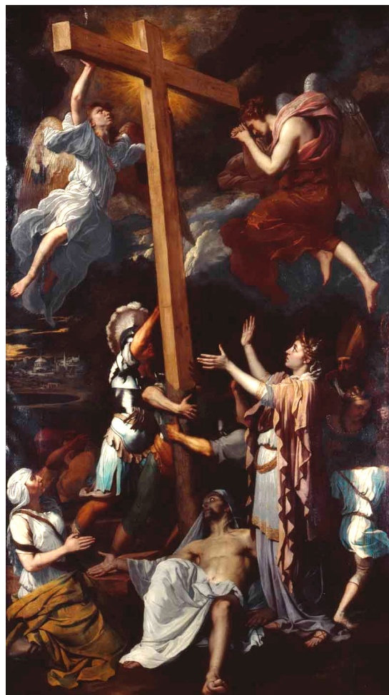
The Finding of the True Cross

The Rogation, or Asking Days are next week, Monday-Wednesday (May 6, 7, 8). The Processions and Litany precede the 11:25 AM Masses. Come with your intentions to be offered up with those of the Church during these great days of powerful prayer.