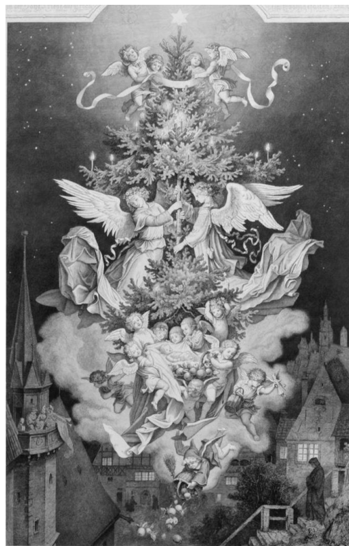
Die Christnacht (Christmas Eve) by Ludwig Reichter, depicting the angels bringing the Christ Child to earth