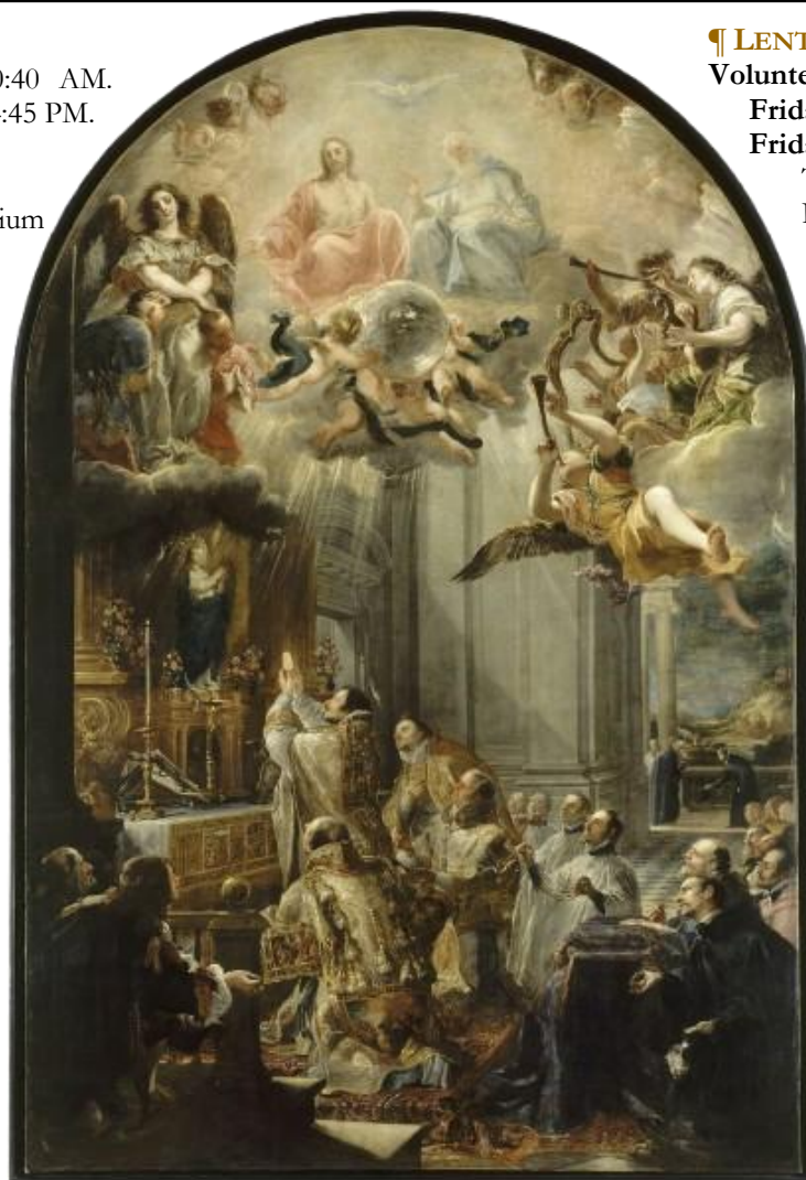
The Mass of St. John of Matha

Sunday, February 1st.....$9,048.00 Second Collection.....$3,135.00